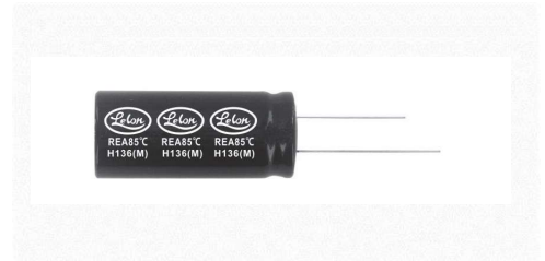
Sleeve & Marking Color: Blue & Black